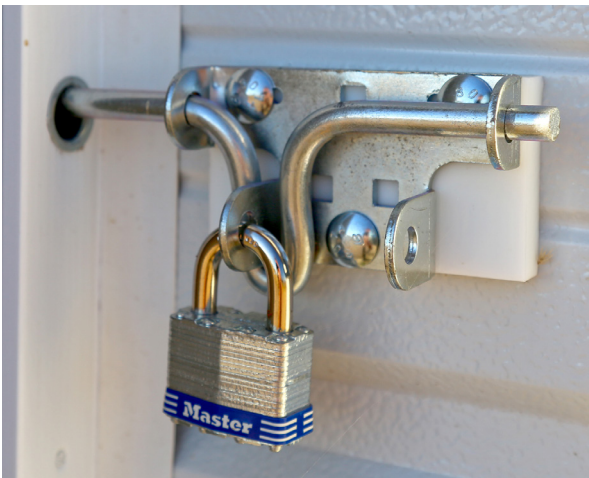
Mini Warehouse Lock pictured above.