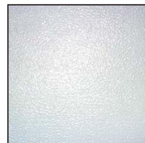
Pebble Texture Finish Exterior and Interior